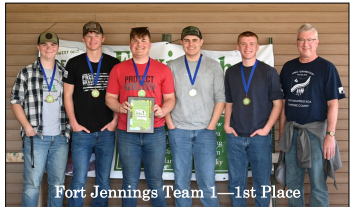
Fort Jennings Team 1—1st Place